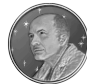
2023 Robert Heinlein Award Winner TBA

Sponsored by the Baltimore Science Fiction Society, a 501(C)(3) non-profit educational organization. PO Box 686 Baltimore, MD 21203-0686