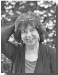
Guest of Honor JANE YOLEN

Renaissance Baltimore Harborplace Hotel 202 East Pratt St. Baltimore, MD 21202